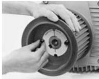
TIGHTEN SCREWS FINGER TIGHT