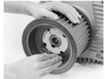
TIGHTEN SCREWS ALTERNATELY