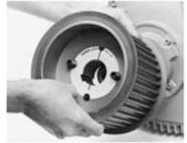
INSERT SCREWS AND LOCATE ON SHAFT